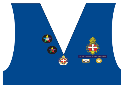
From Sept 2018, Explorer Awards