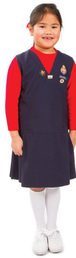
Explorer Ceremonial Uniform