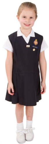
Explorer PE Uniform